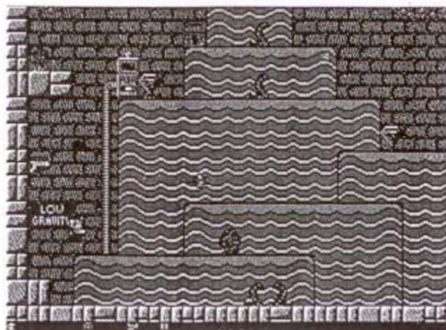
Some of the horrors that Mylo has to battle with are egg-dropping aliens and roaming snakes.

Mylo must avoid contact with aliens while collecting crystals, because he has only three energy bars. Whenever he comes in contact with the enemy he loses one bar. And when all the bars are exhausted, Mylo dies. But his dying does not exit you out of the game, all you have